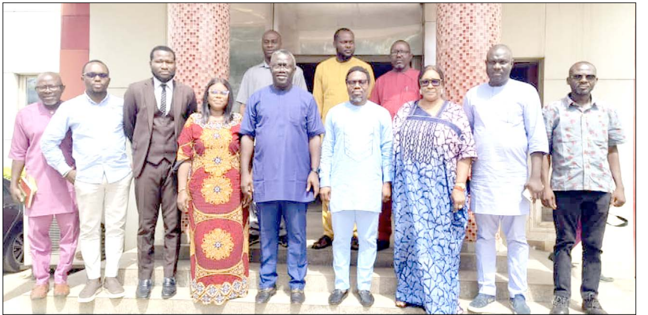
OREDO BUSINESS SUPPORT AND INVESTMENT FACILITATION OFFICE:

The significance of this partnership resonates not only within Ogun State but also on a national scale. By leveraging Germany's expertise and resources, Ogun State aims to position itself as a leading contributor to Nigeria's food security agenda. Through the adoption of modern farming techniques, provision of necessary infrastructure, and strategic collaborations, the state is poised to emerge as a pivotal hub for agricultural innovation and production.