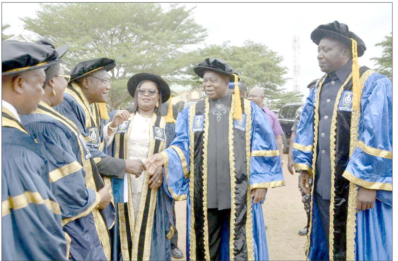
UNIDEL FOUNDER'S DAY CELEBRATION: